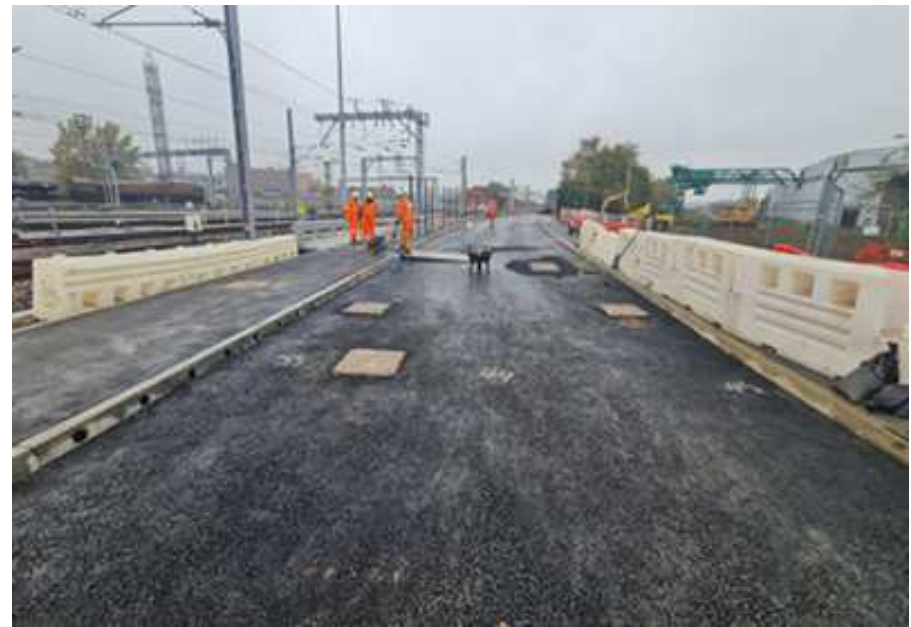
Completed tarmacadam surfacing to the TOC access road and walkways