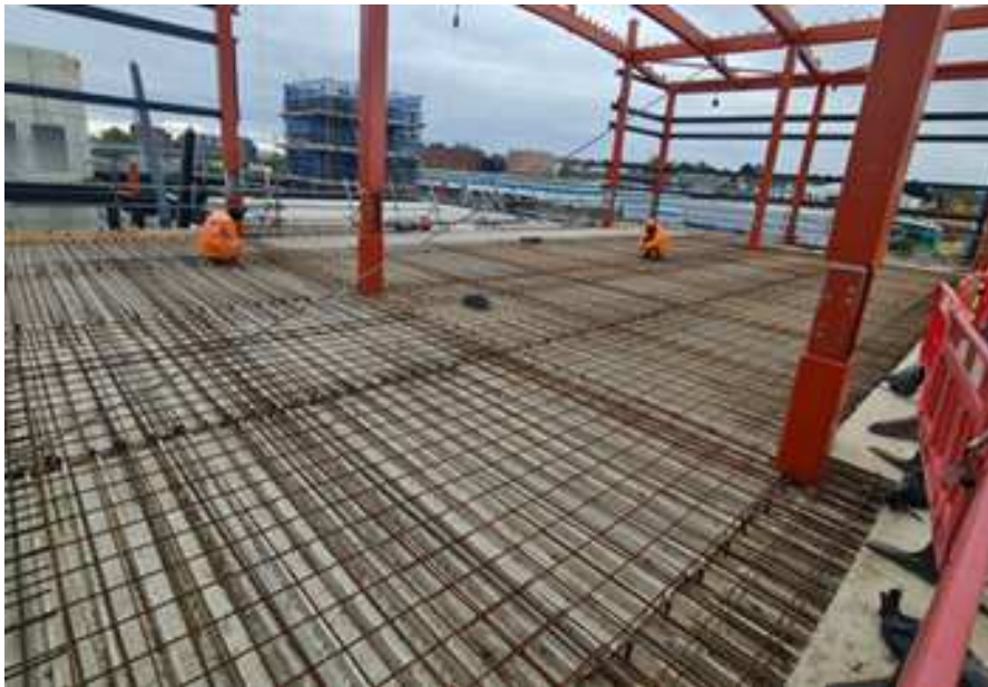
Fabric reinforcement to the next section of the Concourse