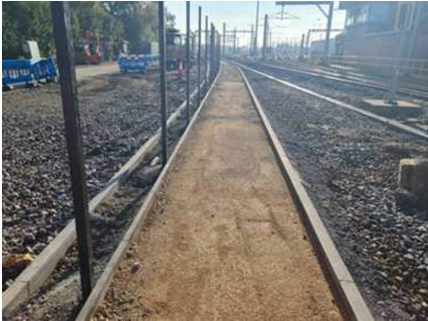
Preparation of the new access road and Drivers Walkway for Tarmac Surfacing