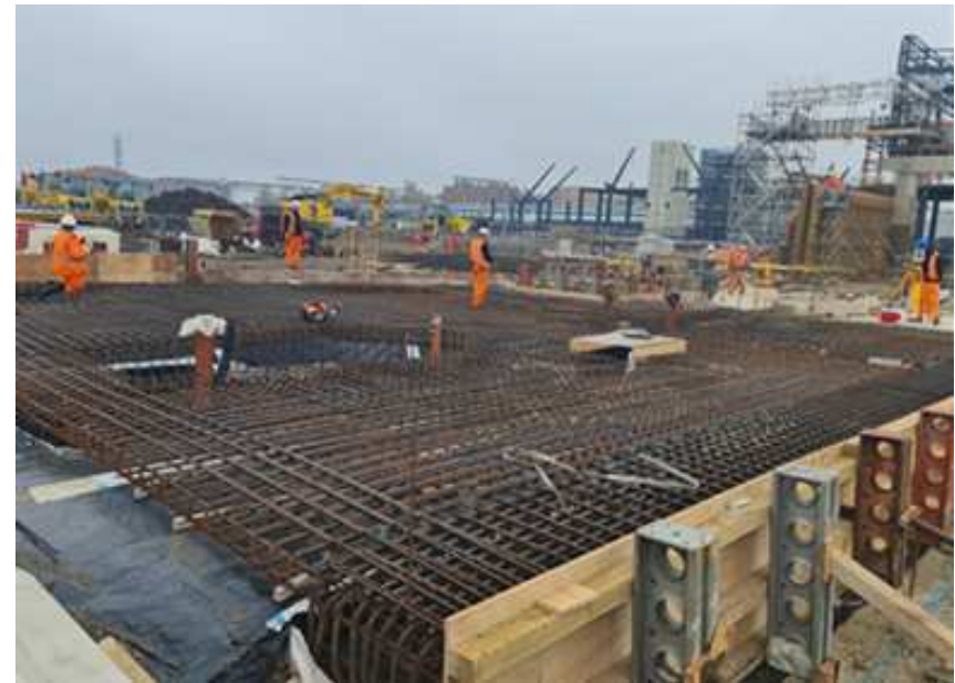
Preparation for concrete pour to the final section of SEEB floor slab