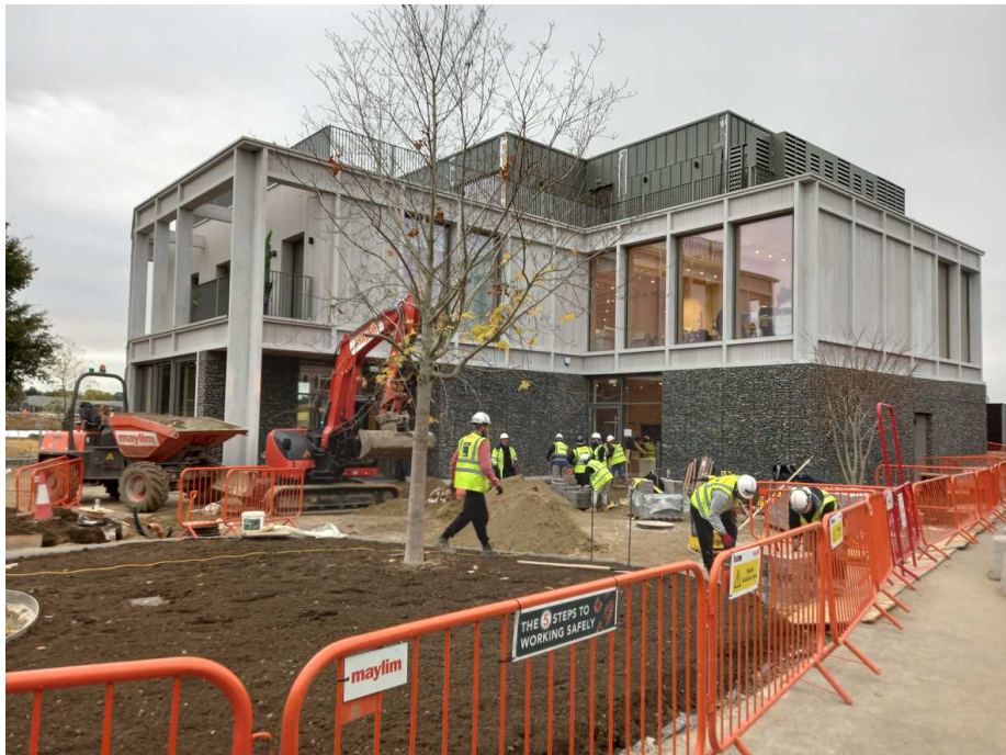
Visitor Pavilion nearing completion